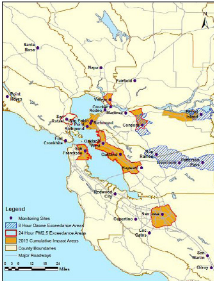
Figure 1: 2013 Impacted Communities

For over sixty years the Air District has been implementing programs to reduce air pollution and public exposure. Air District actions include: conducting air monitoring and modeling to identify locations of elevated pollution concentrations and to assess potential health impacts (see Figure 1); adopting regulations, plans and guidelines to reduce emissions from stationary (i.e. industrial) and mobile (i.e. cars) pollution sources; enforcing existing Air District regulations and the state's mobile source regulations; providing grants and incentives to reduce emissions from mobile sources (targeted in the Bay Area's most impacted communities); and outreach and education to Bay Area residents on air quality issues and trends. These efforts, in combination with the California Air Resources Board's (ARB)